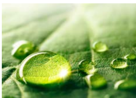
Hydrophobicity CHT-COAT WAXES