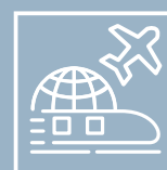
SilSo TRANSPORTATION Mobility & Transportation