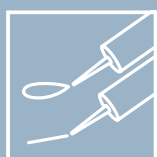
SilSo ADHESIVES Industrial Adhesives