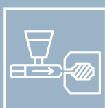
SilSo INJECTION MOULDING Liquid Silicone Rubber