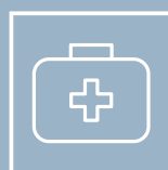
SilSo MEDICAL Medical Applications